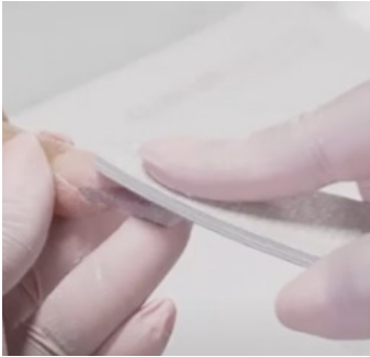
4 File the center of the nail at a 0-degree angle. Support the free edge under the nail with your finger while you file.