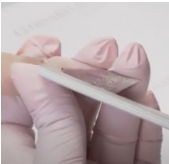
8 File the side grooves straight.