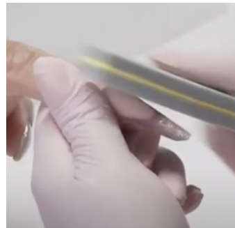
10 Buff and clean and you're done!