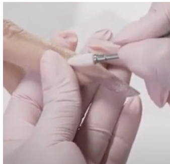
9 Use the e-file to perfect the cuticle area using a ceramic bit.