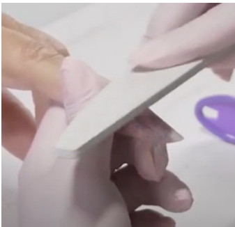
6 File the cuticle area very slowly and carefully so as not to cut the skin.