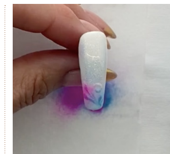
6 Repeat step 5 with additional color and sprinkle over another part of the design.