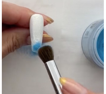
Fill fluffy brush with one color of dip powder and dust over part of the design.

Using a detailer art brush, create white swirls or designs at the free edge of the tip.