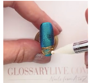
7 Using a metallic gold UV/LED spider gel, create horizontal lines at the front of the tip for a stylish design look.