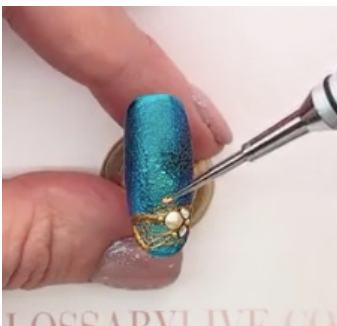
8 Decorate the lined area with pearls and crystals set in UV/LED gel to create simple yet elegant nail art.