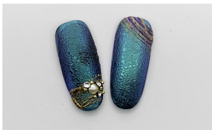
9 Cure and enjoy your foam textured design.