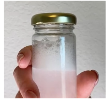
5 Place soapy water in a glass bottle and shake to create a fine foam.