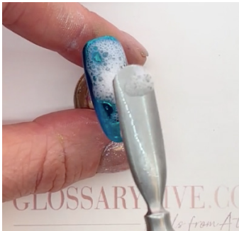
6 Using a cuticle pusher, grab the soapy bubbles and apply to the surface of the nail. Cure.