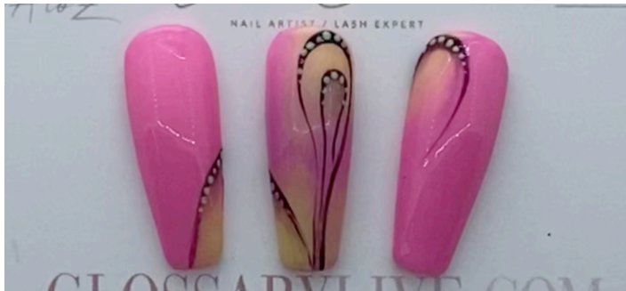
12 Enjoy the final look.