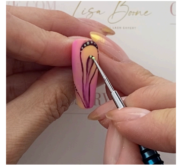
10 For that little extra, use the small dotting tool end and dip in UV/LED white paint and apply small white dots on the thinner lines of the design. Cure.