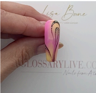
11 Apply LED/UV gel top coat, cure and cleanse.