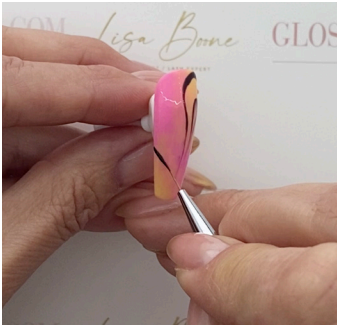
7 Mimic this design on other areas of the nail. Cure.