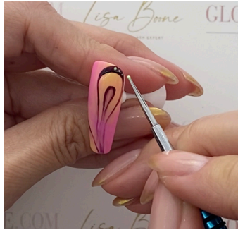
8 Use a dotting tool and apply small white dots on the thicker black lines. Space them as equally as possible to create harmony in the design. Cure.