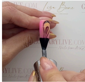
9 Apply LED/UV gel top coat, cure.