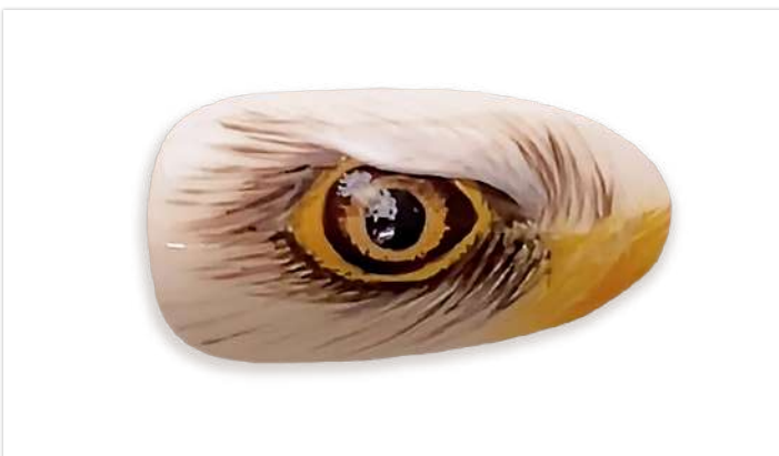
The final look

18 Apply UV/LED top coat & cure to complete.