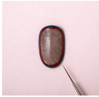
6 Draw a border around the nail tip using Biscay and Potter's Clay UV/LED colors and cure.