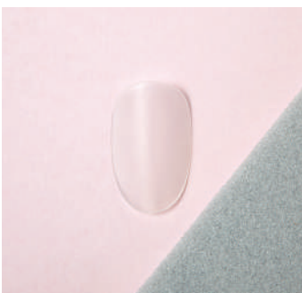
1 File and shape your chosen nail tip. Apply base UV/LED gel and cure.