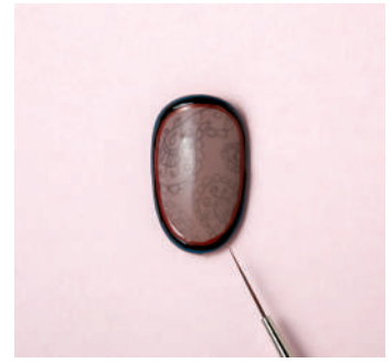
7 Draw a line inside the border using Black Tulip UV/LED color and cure.