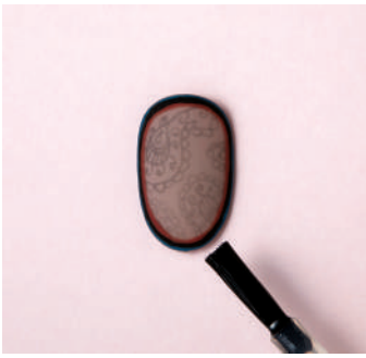
8 Apply non-wipe Velvet UV/LED Top Gel and cure.