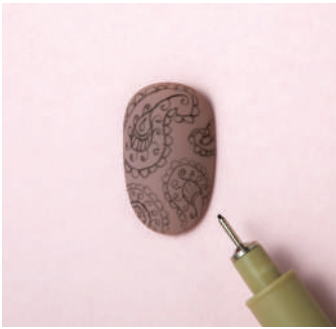
4 Draw a paisley motif using a Pigma nail art pen.