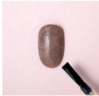
5 Apply Slider UV/LED Top Gel and cure, then wipe off the sticky inhibition layer.