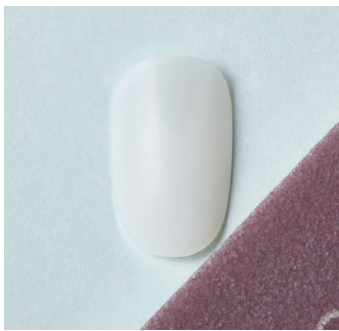
1 Prepare your tip by sizing & filing to shape.

GETTING PREPARED Prepare your table in an organized manner eliminating cross contamination from the products. Make sure all necessary products are within hand's reach, so the products are ready to use on the nail desk.