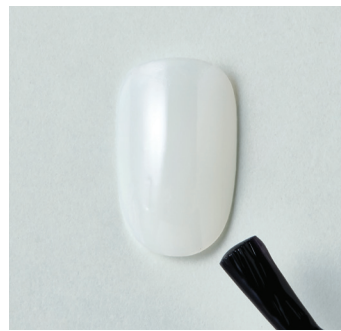
2 Apply UV base gel & cure.