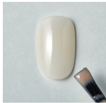
3 Apply UV/LED gel base color & cure.