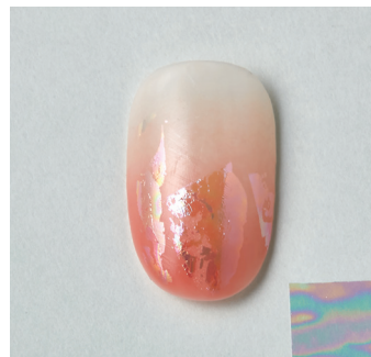
6 Stick the art foil onto the bottom surface area of the nail tip.