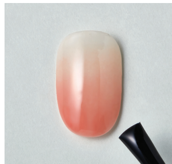
5 Apply UV/LED base gel & cure then wipe off the inhibition layer.