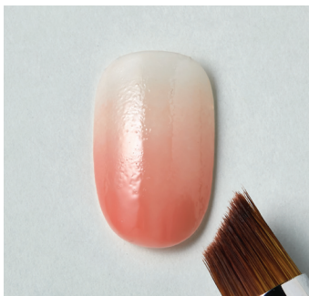
4 Apply a rose color & blend the two colors & cure.