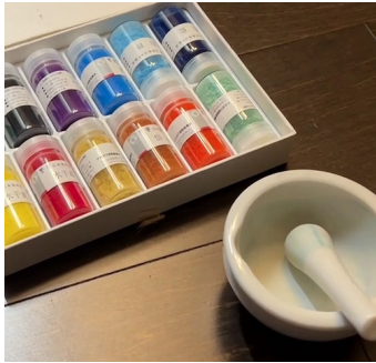
Colored powder pigments.

Cover pink powders are either nude, natural or skin-toned in color. Depending on the amount of monomer in your bead, cover pinks will be more translucent or opaque and therefore will present a different type of coverage.