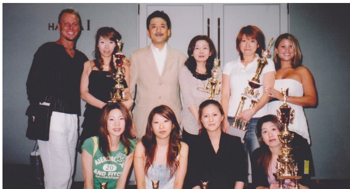
Competing in Japan back in the 90's.