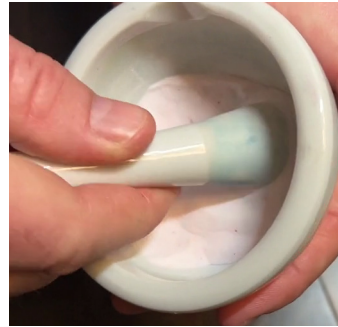
Grinding the pigments with white polymer powder to create the cover pink shade.