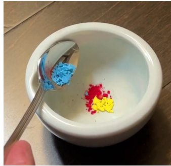
Mixing colored pigments to create a cover pink that matches the client's skin-tone for the most natural looking nail enhancement.