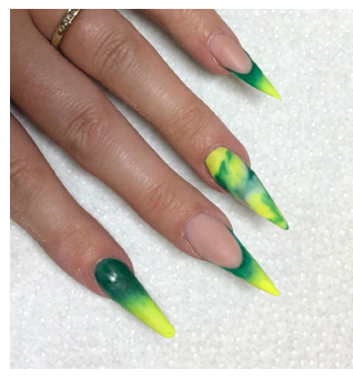
Take colored acrylic powders in neon yellow and green to create an ombré fade effect as a French on two nails, cover one entire nail tip & then marble the colors together on the ring finger.

Apply tips to all 10 nails & prep accordingly. Create a reverse French on selected nails, then add a clear/ nucle thin base on the remaining nails.