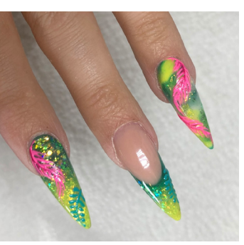
Use gel art paint in hot pink and green to paint a raised design over the nails & add any crystals using thick adhesive gel to secure them, cure & finish with oil.

Cap all the nails in clear L&P acrylic. File & top coat.