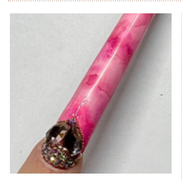
Apply a thick LED gel like Akzentz 'bling on' to the nail in areas where you'd like to embellish with crystals. Apply the crystals, spreading out any excess gel smoothly before curing.