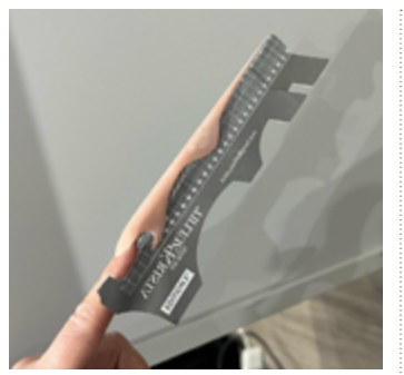
Sculpt the shaped lower arch onto the stiletto using the guidelines on the nail form to create your style.