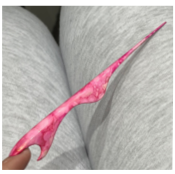
Use the sponge to randomly press the colors onto the nail.