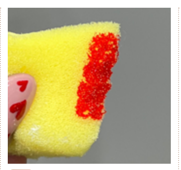
Apply alcohol ink in hot pink, red and gold onto a sponge (you can try different sponges eg. Make-up or kitchen sponge) for different effects.