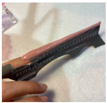
Sculpt out a stiletto shape in liquid & powder. Keep the form shut tight.

Prepare your table in an organized manner eliminating cross contamination from the products. Make sure all necessary products are within hand's reach, so the colors are ready to use on the nail desk.