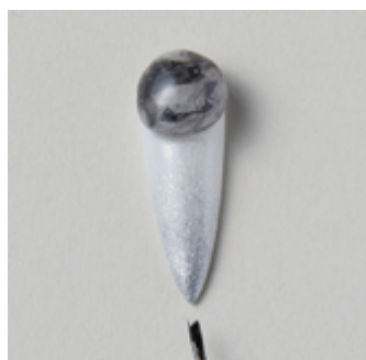
5 Swirl a liner brush with black gel polish into a bead of clear builder gel to create a marble effect. Attach to the nail and cure.