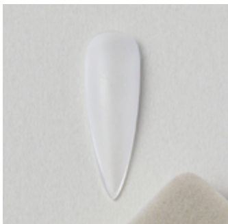
1 Buff the shine off of the nail tip.