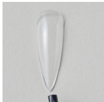
2 Apply Signature Fit Base Gel then cure.