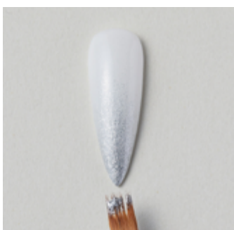
4 Apply MP.309 or a silver gel polish on the lower third of the nail and fade up the nail with a graduation brush.