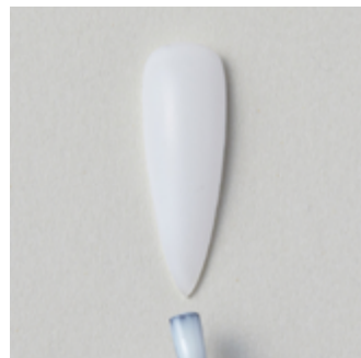
3 Apply DGEL DT.11 or a soft white gel polish and cure.